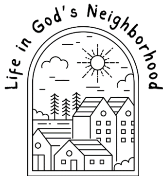
FAITH LESSONS FROM MR. ROGERS A Summer Worship Series

The World According to Mister Rogers: Important Things to Remember