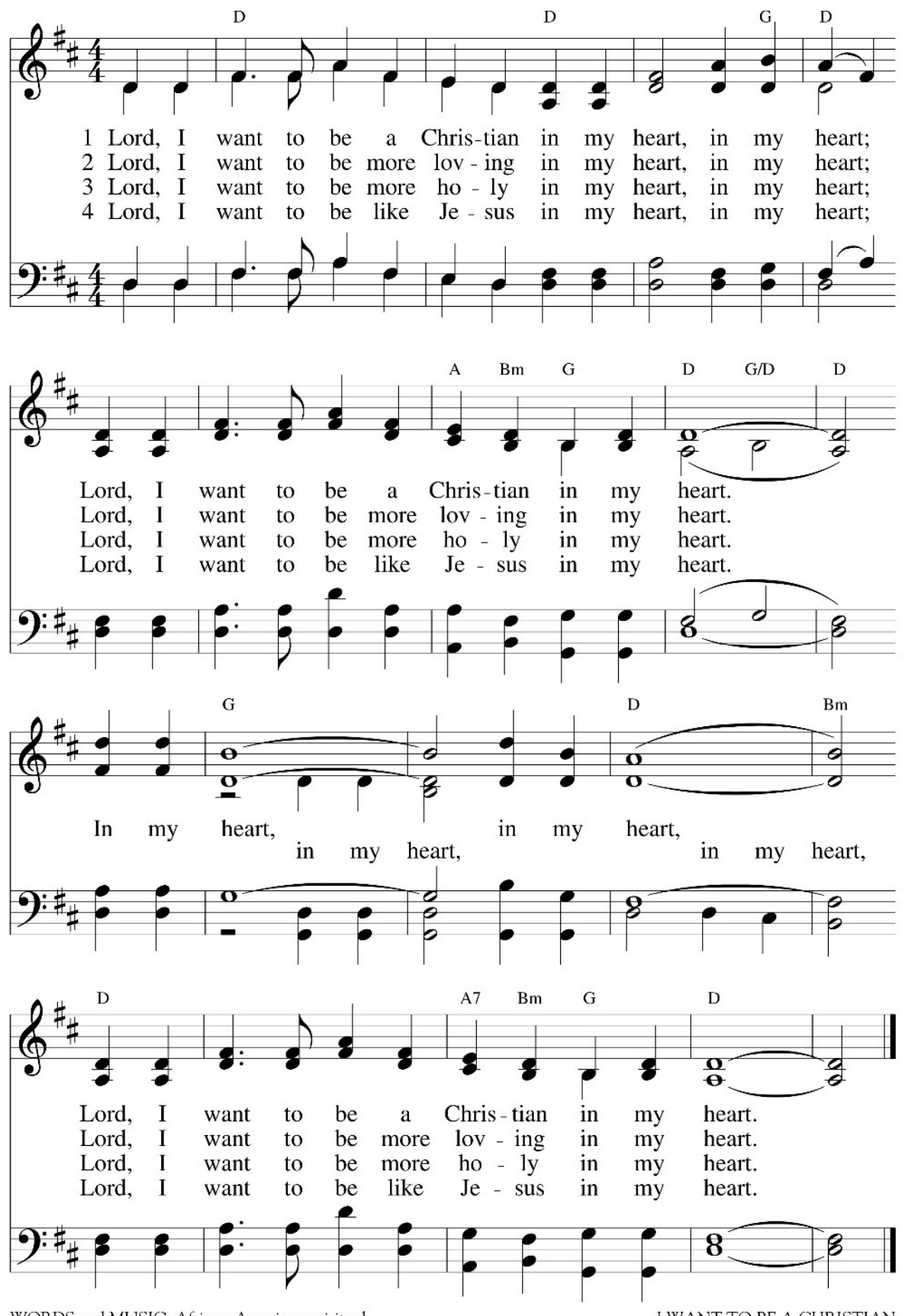
457 Lord, I Want to Be a Christian