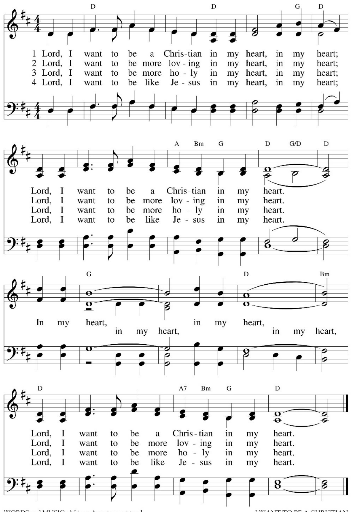
457 Lord, I Want to Be a Christian